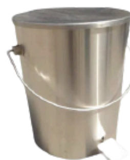
FOOD OPERATED DUSTBIN