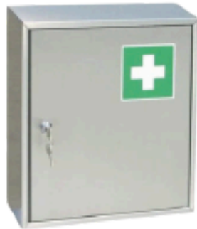
FIRST AID BOX