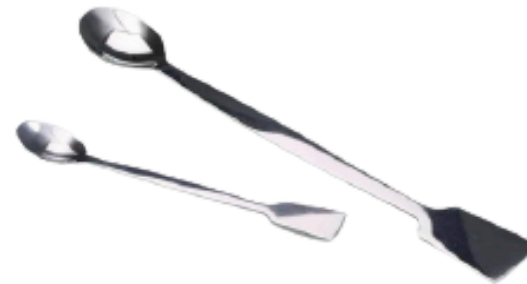
SPOON & SPATULA