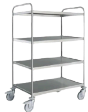
MUTI UTILITY TROLLEY