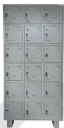
MS POWDER COATED LOCKERS