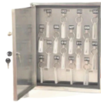
KEY STORAGE BOX