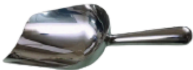
OPEN TYPE SCOOP