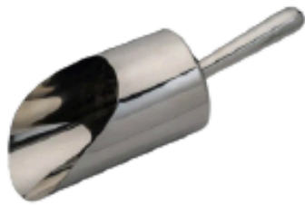
CLOSE TYPE SCOOP