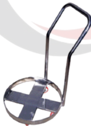
CONTAINER & DRUM TROLLEY