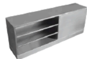
CROSS-OVER BENCH BENCH RANK