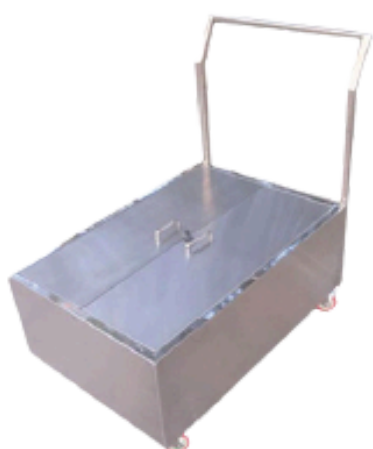
WEIGHT BOX TROLLEY